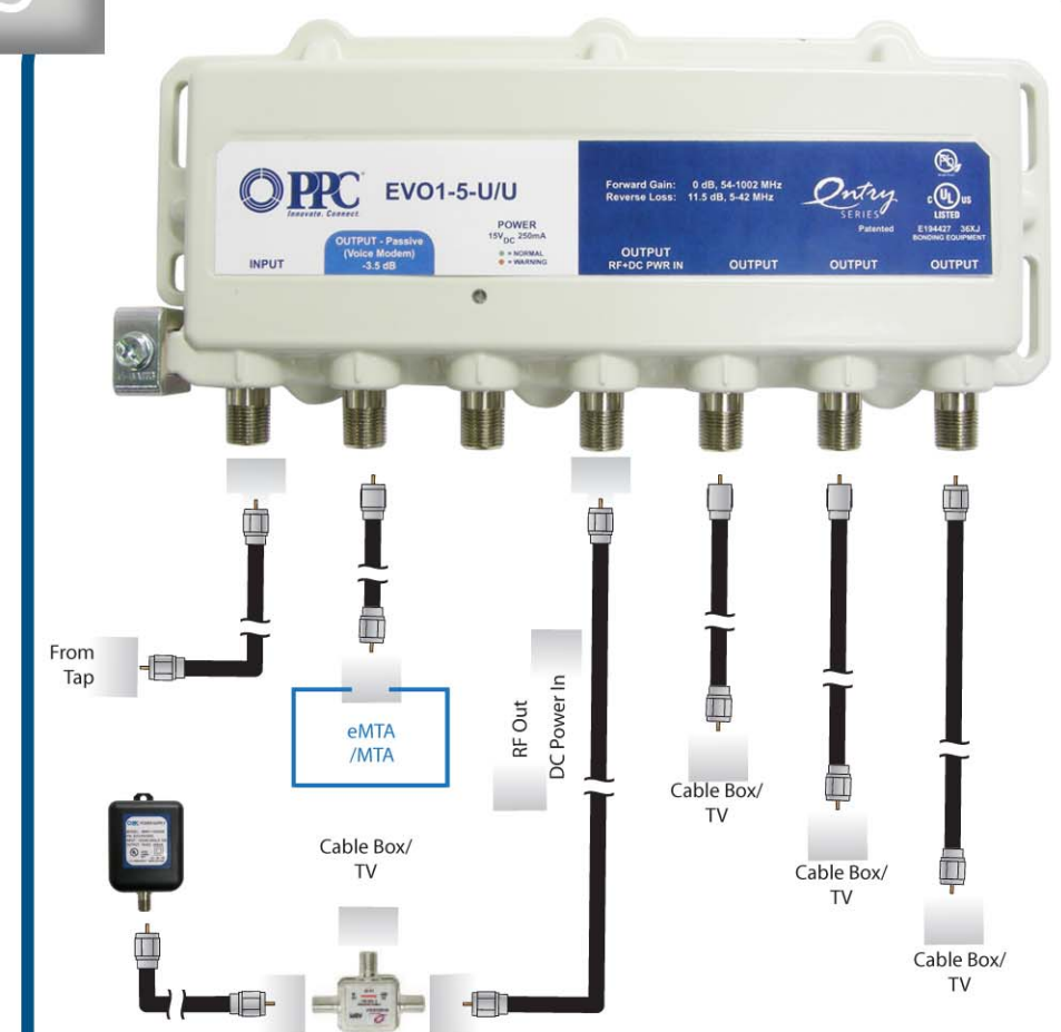
Powering with optional EVO1-PI EVO-PS15400 with power inserter