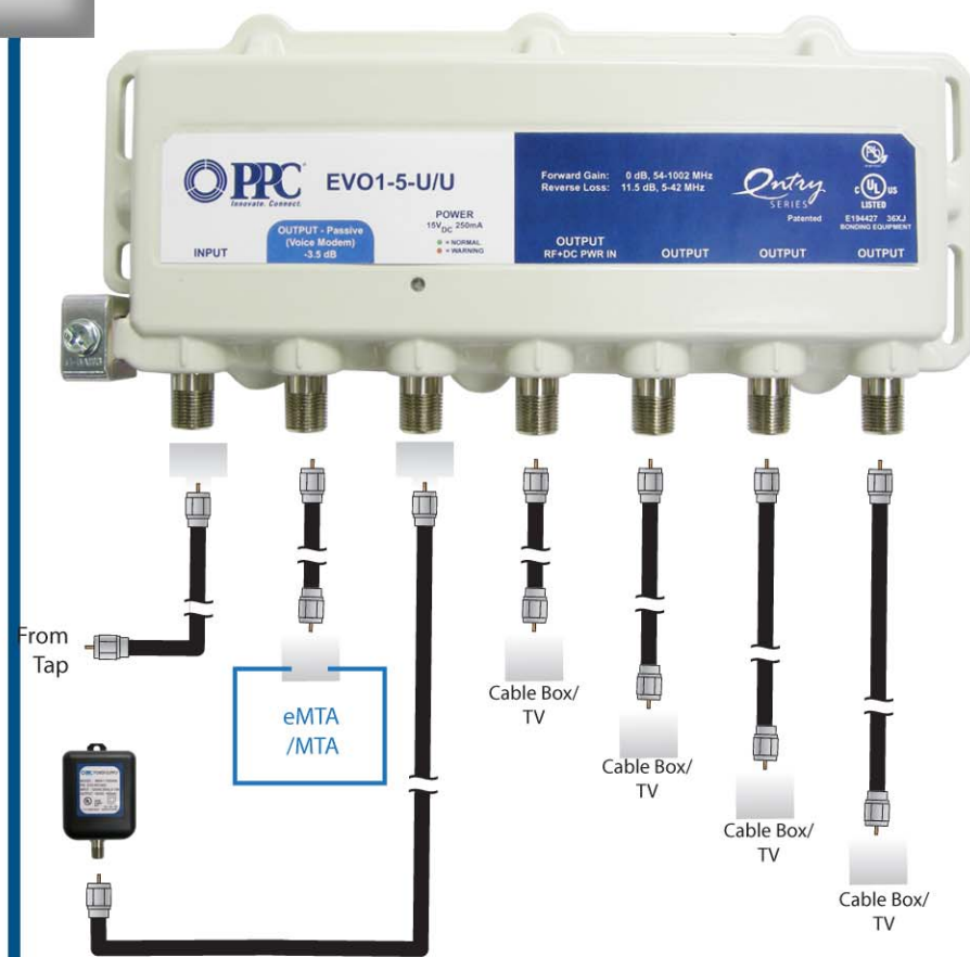
Standard Powering with EVO-PS15400