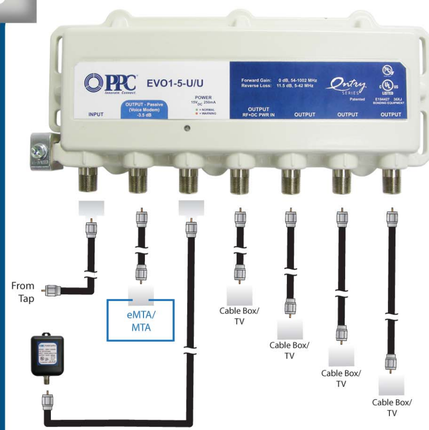
Standard Powering with EVO-PS15400