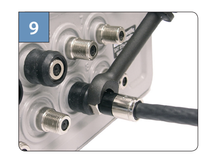
Tighten connector to recommended torque.