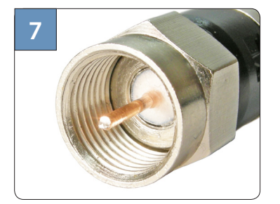
Dielectric is flush within the post.