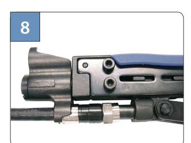
Properly seat connector and compress fully.