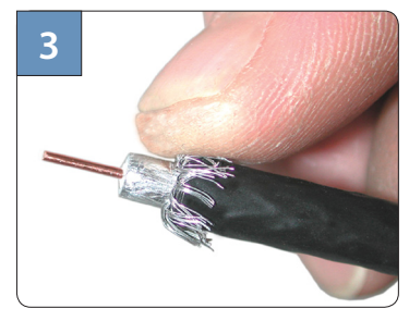
Fold back braid. If Trishield or Quadshield remove additional foil layer and fold back remaining braid.