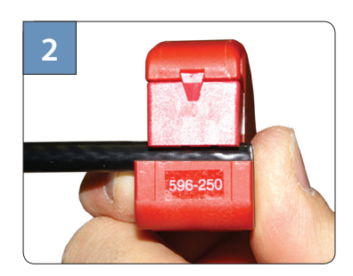
Using a fixed blade prep tool in good condition, prepare cable to 1/4" x 1/4" dimensions. Use edge of tool if no stop.