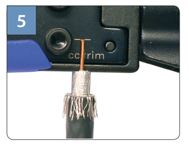
Ensure cable is perpared to 1/4" x 1/4" dimensions. Use guage on VT tool to recheck center conductor.