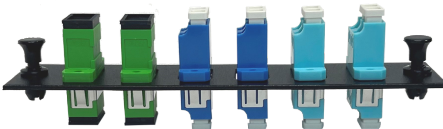
Hybrid Panel Insert